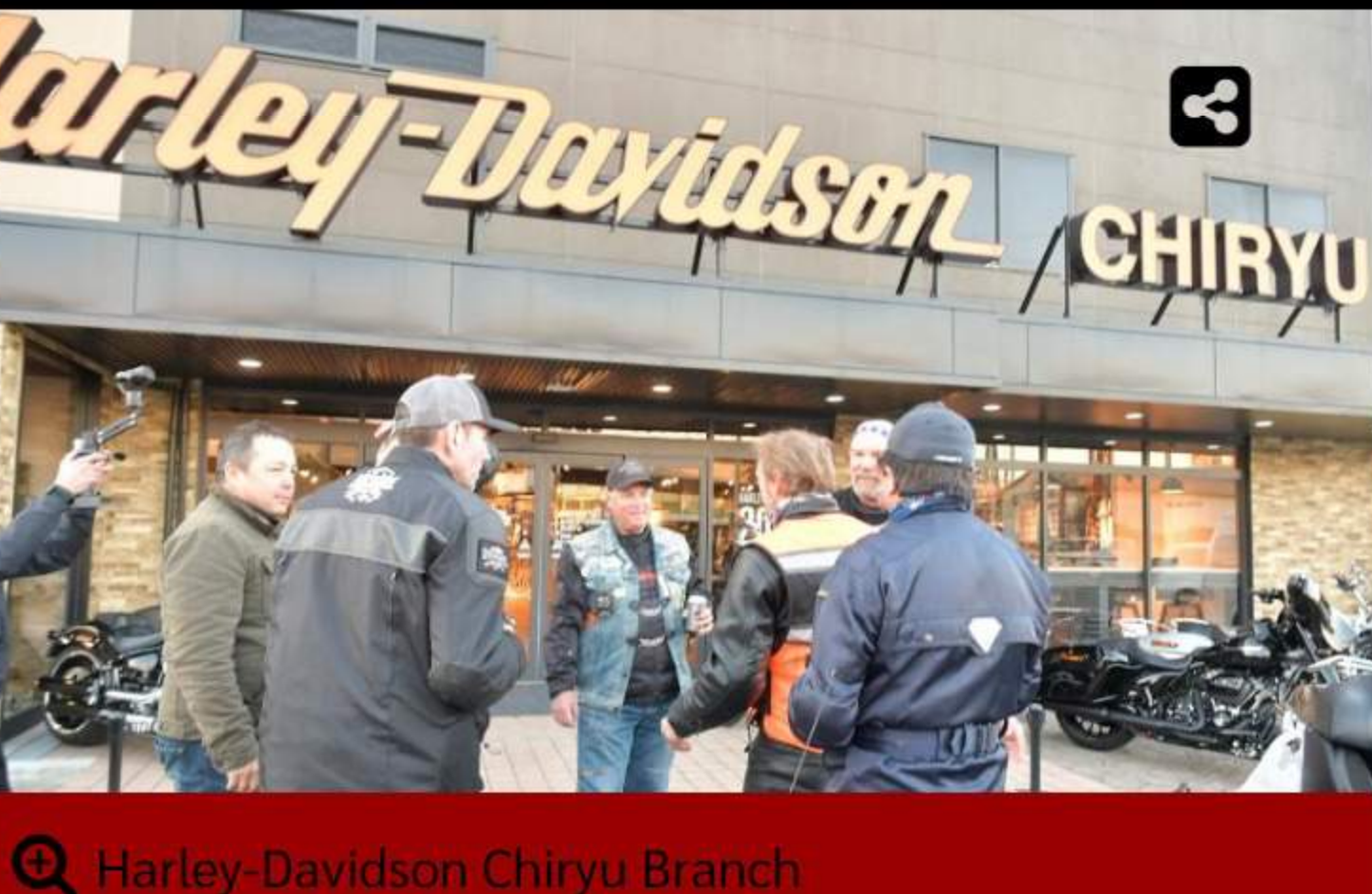
Harley-Davidson Chiryu Branch