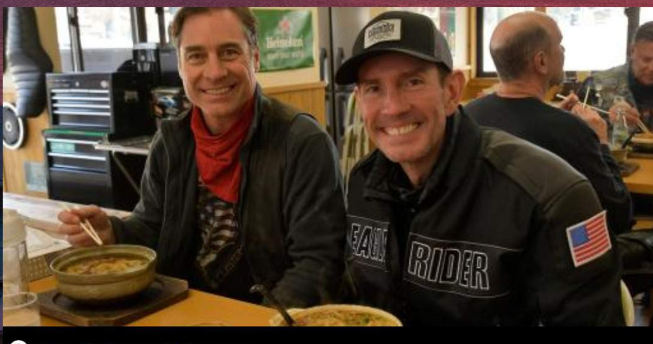
Sena Teahouse, Shirayama