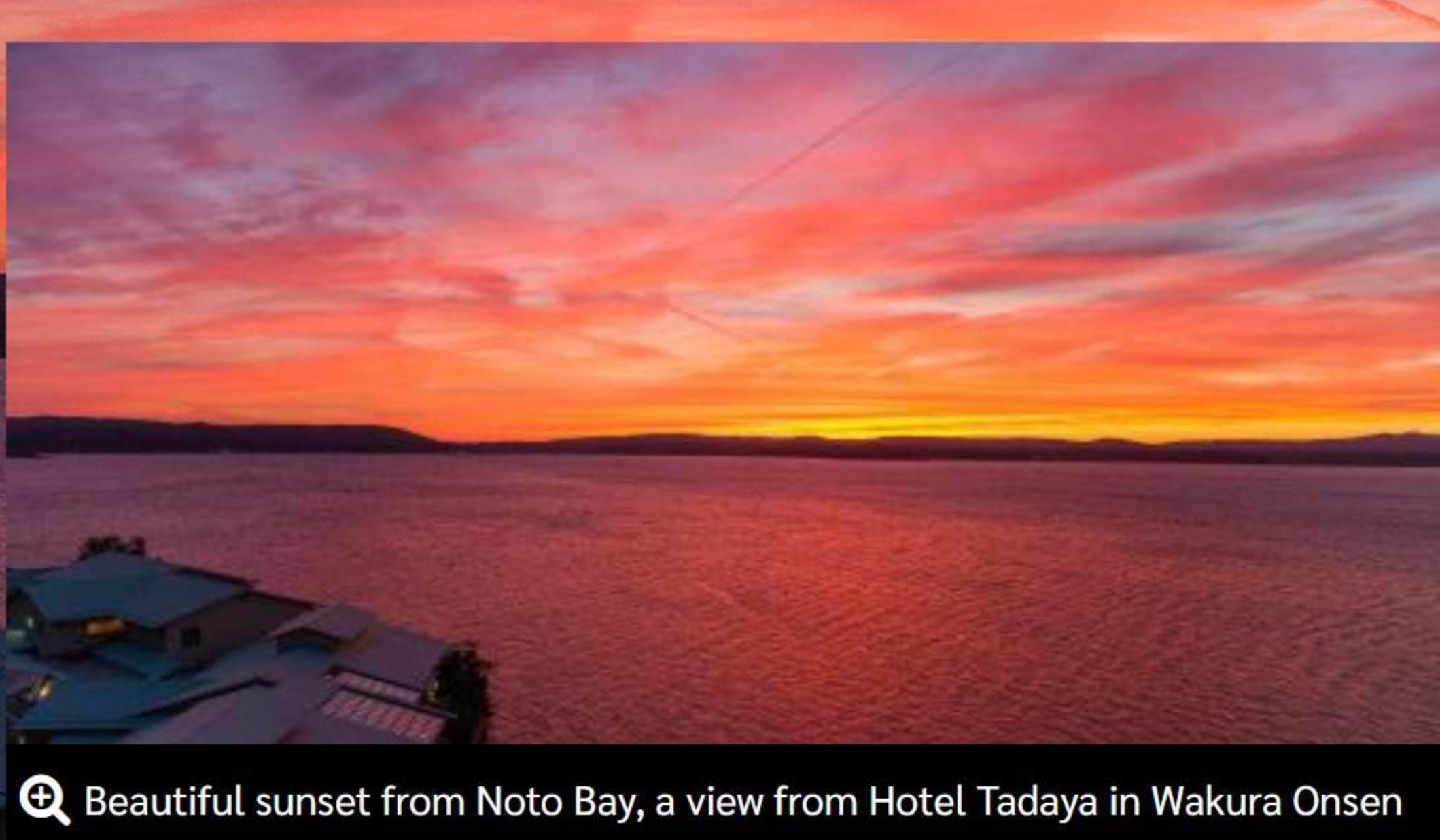
Beautiful sunset from Noto Bay, a view from Hotel Tadayu in Wakura Onsen