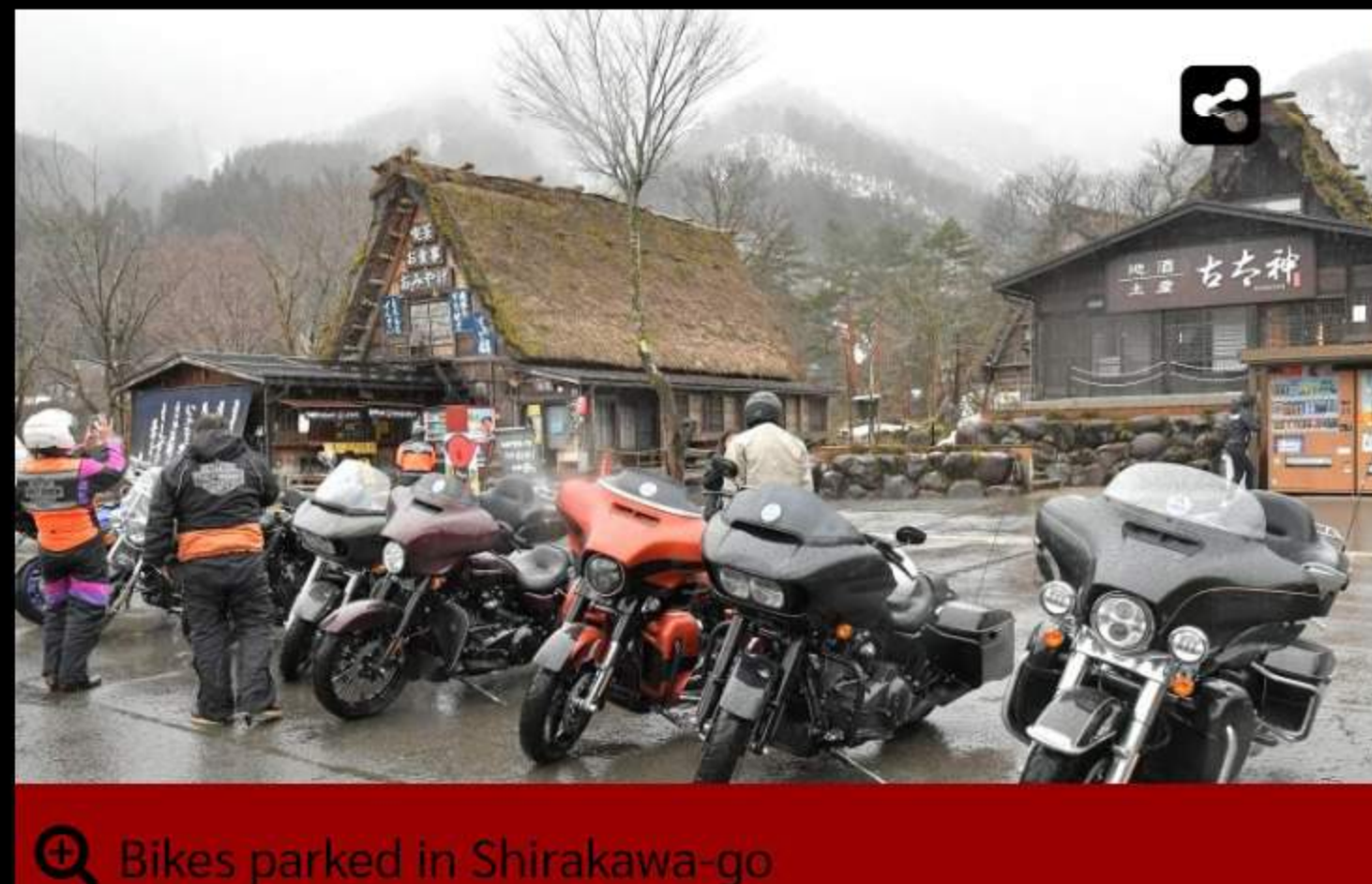
Bikes parked in Shirakawa-go