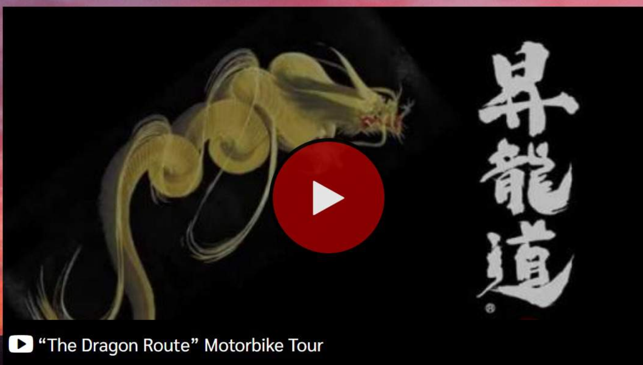
“The Dragon Route” Motorbike Tour

Nanao, Japan, March 20, 2019 – This tour, traveling the Dragon Route on Harley Davidson bikes and covering approximately 1,000 km over 5 days, began on March 4, 2019. The Route travels from the Pacific Ocean point to dragon-head shaped Noto Peninsula facing the Sea of Japan. Sponsored by the Japan National Tourism Organization, the Dragon Route Promotion Council organized this FAM trip with Moto Tours Japan targeting foreign visitors. Members of Eagle Rider were invited along with representatives from the Harley Owners Group to tour around the exquisite locations in Japan.