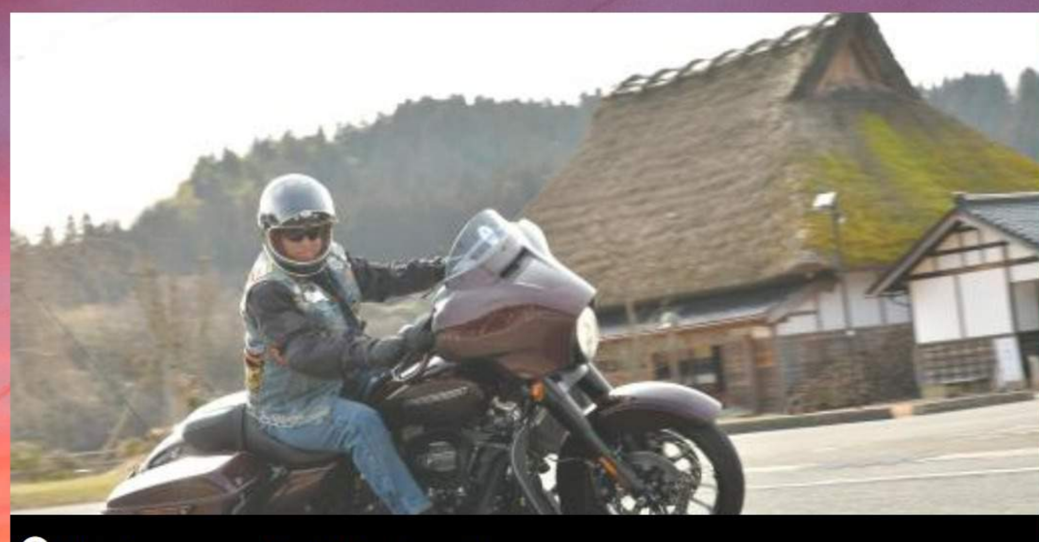
Shirakawa-go – World Heritage Site