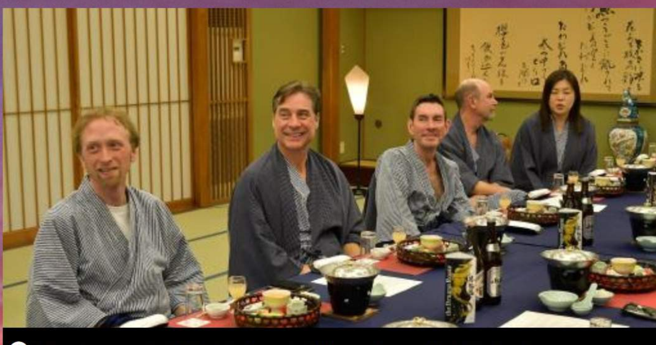
Enjoying meal at Hotel Tadayu in Wakura Onsen (Hot Springs)