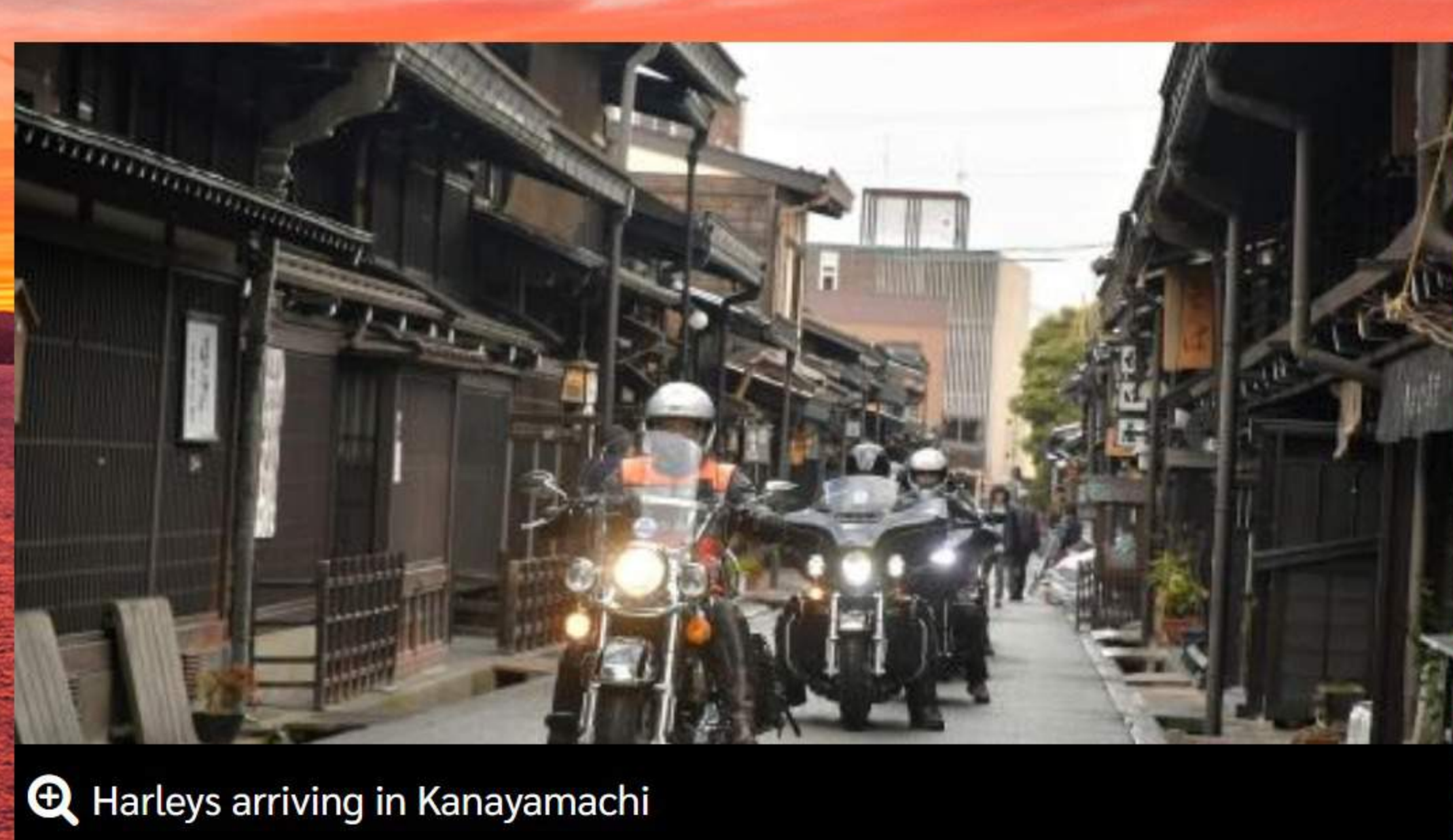
Harleys arriving in Kanayamachi

The group departed from the Rental819 Shop at Chubu Centrair International Airport on March 4 and visited Nagoya Castle, Atsuta Shrine and Gifu Castle. From there, it continued on to the 1,300-year-old Natadera Temple in Komatsu City, Ishikawa Prefecture, and then to the Motorcar Museum of Japan, where it enjoyed the profound culture and craftsmanship of Japan.