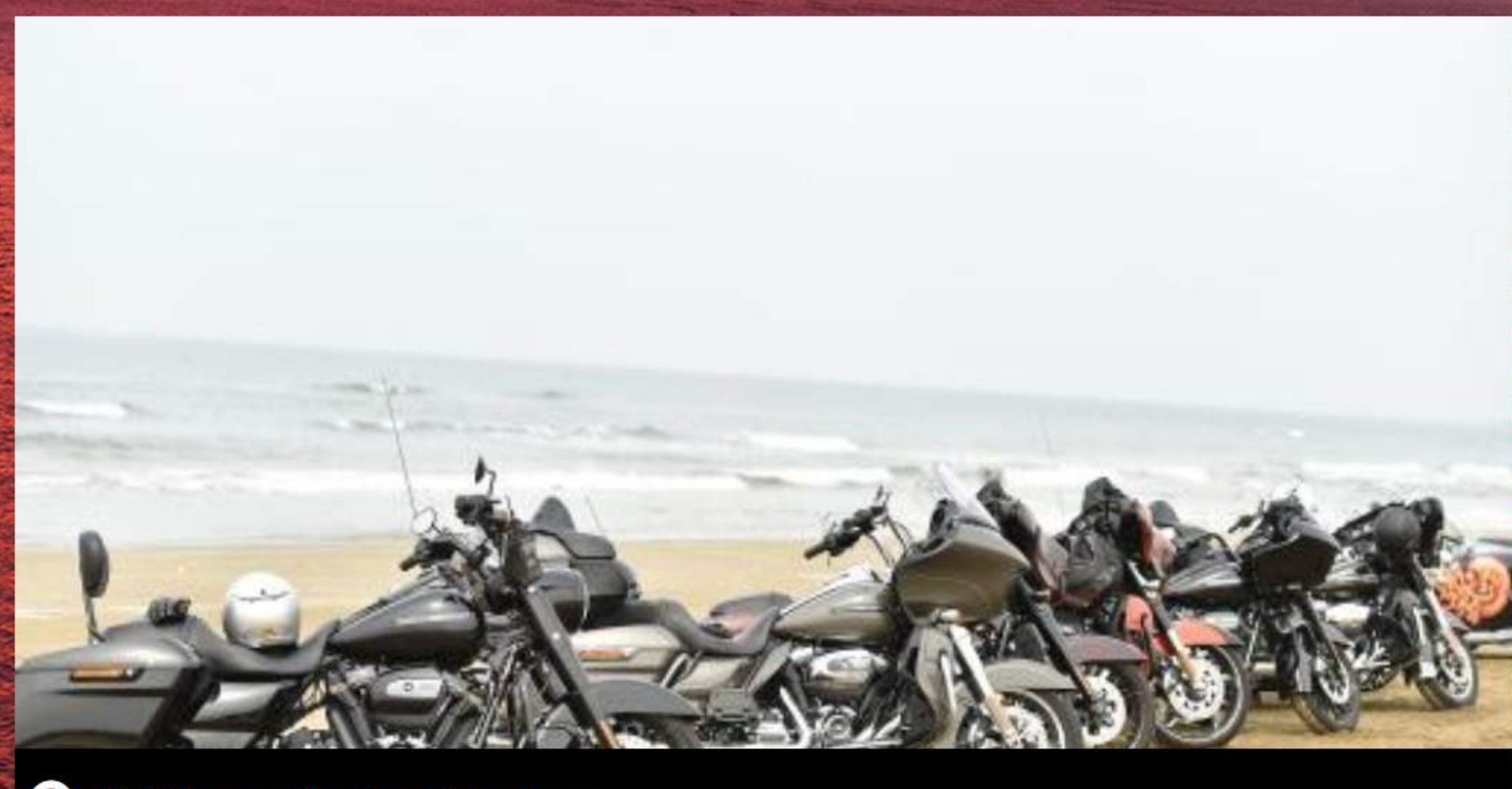
Chirihama Nagisa Driveway